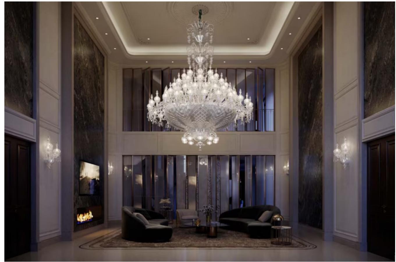
iDOGI, Mille E Una Notte, Chandelier

Amazed, grateful, surprised. The same reactions that one feels in front of the Pauly Collection, a precious testimony that iDogi strongly wanted to acquire and that it now preserves in collaboration with the Cini Foundation.